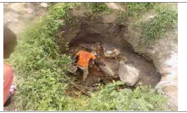
Photo 6: One of the potentially affected sites that might affect artisanal gold miners in Buhweju, Rujunga village.