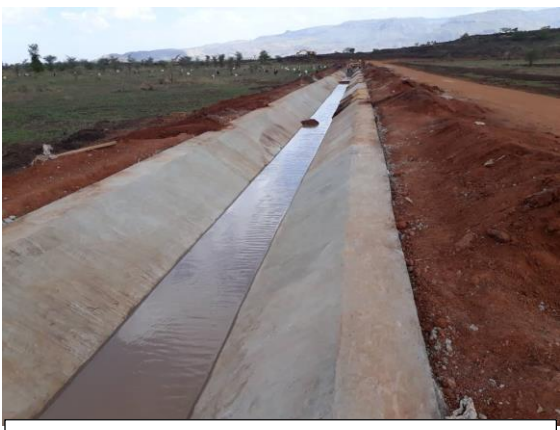
Canal construction at Ngenge irrigation scheme in Kween district