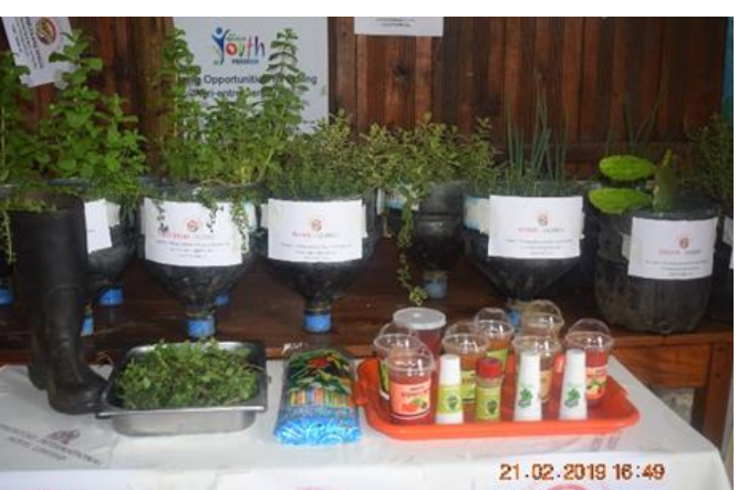
Some of the value added products by the youth from Kasese district for funding support.