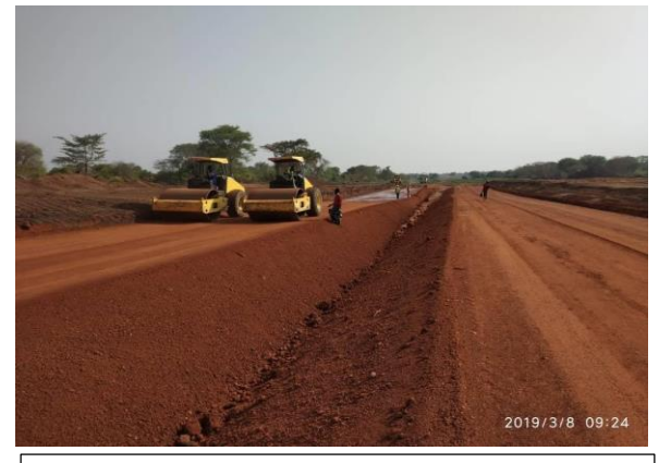
Dam construction at Wadelai irrigation scheme in Pakwach district