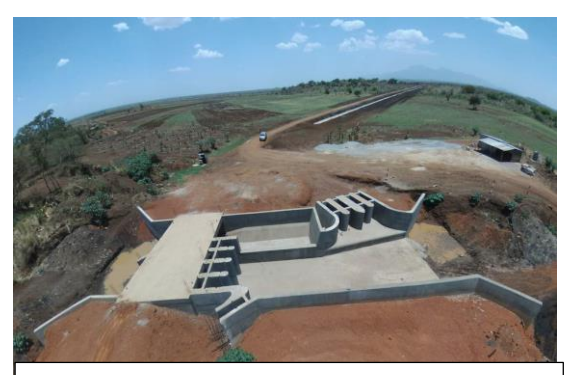
River Kabajiria head works in Kween district