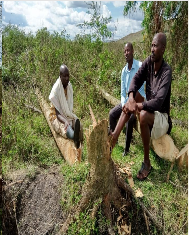
The 1 st photo shows restoration activities by blocking drainage channels to allow water spread in the wetland in progress and in the 2 nd photo are some of the wetland restoration committee members overseeing the communities restoring.