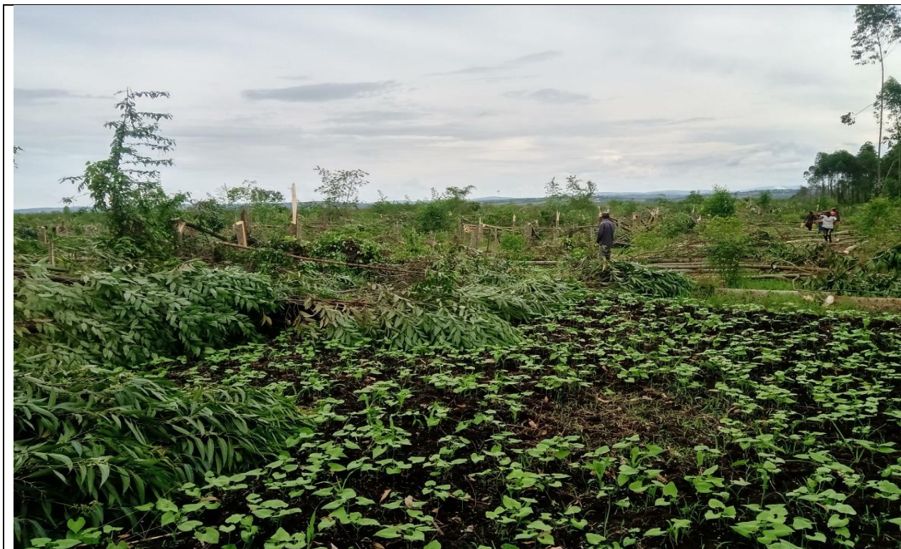
The above photo shows a restored wetland section after removal of eucalyptus tree species from the wetland and blocked channels.