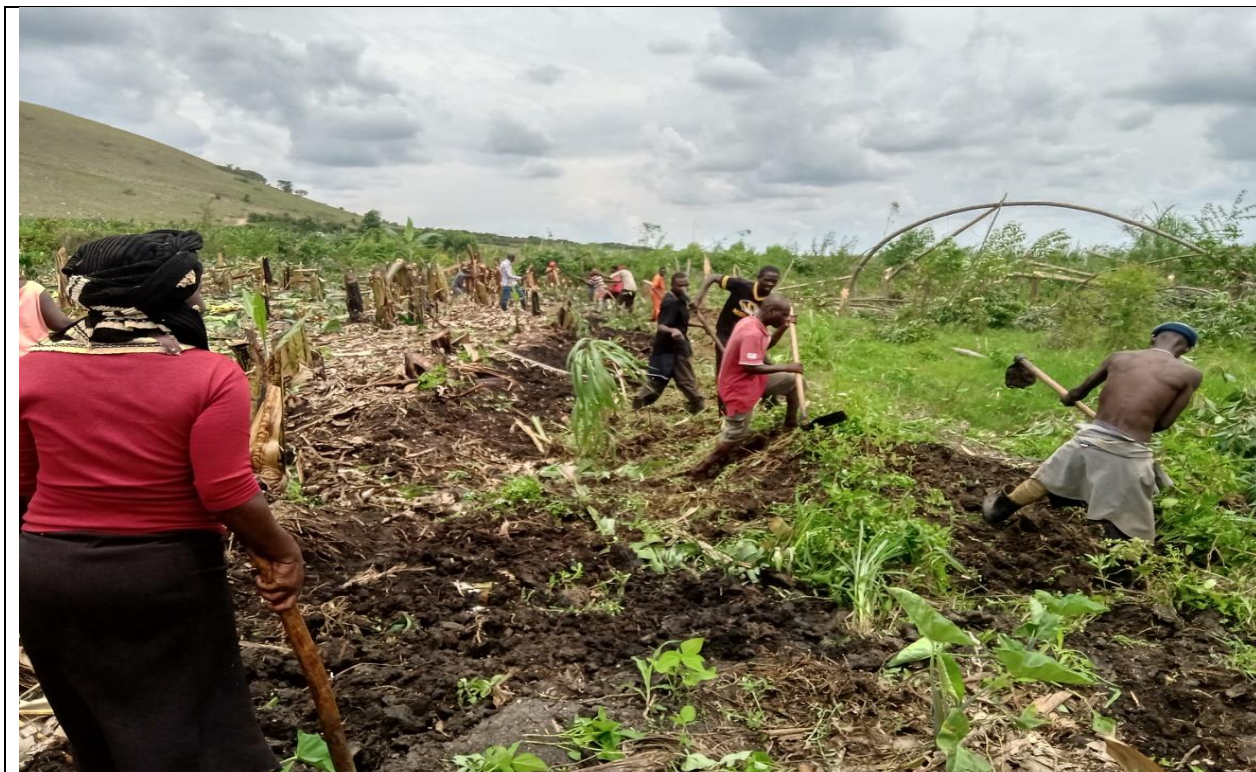
The above photo shows the restored wetland section after removal of eucalyptus tree species and blocking the drainage channels by the community members.