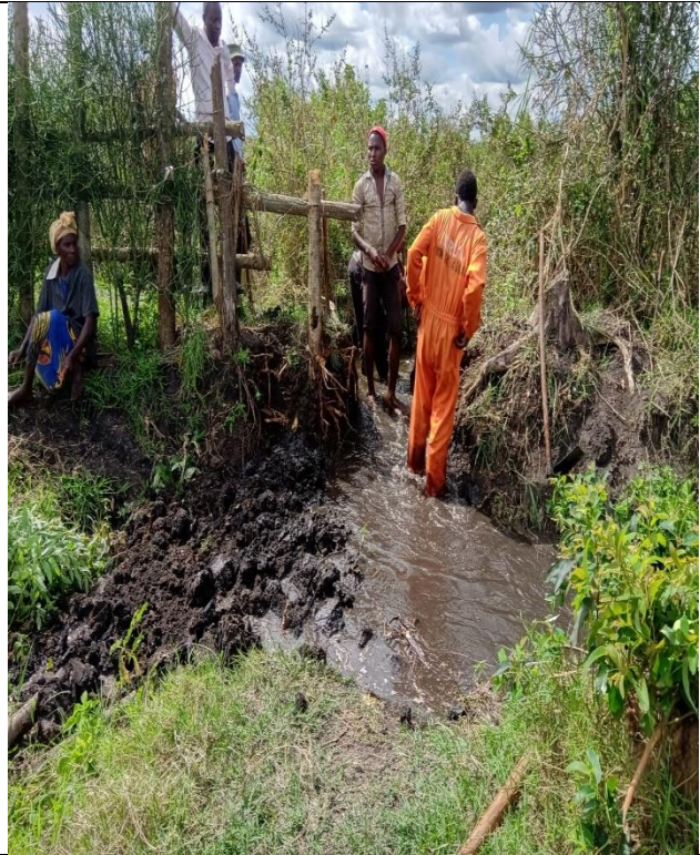
The 1 st photo shows communities opening the drainage channel and the 2 nd photo shows after the channel had been opened to allow water flow all over Rufuha wetland.