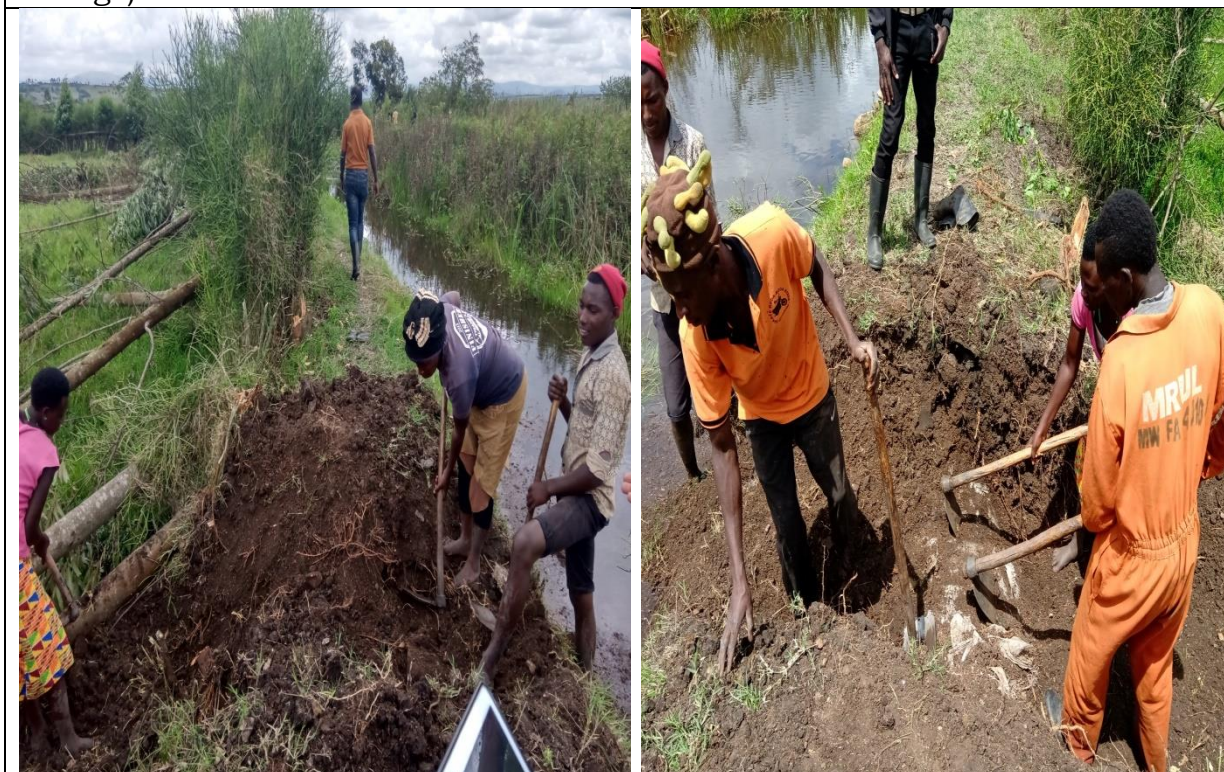
The photos shows community members opening drainage channels which blocked water from flowing all over the wetland.