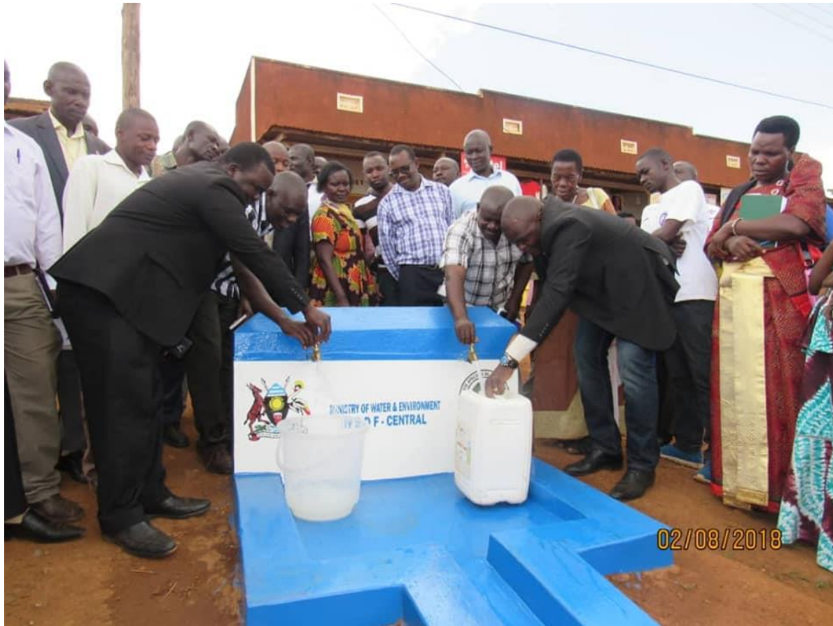
MWE officers inspect the water flow of the Kabwoya public stand post in Kikuube district.