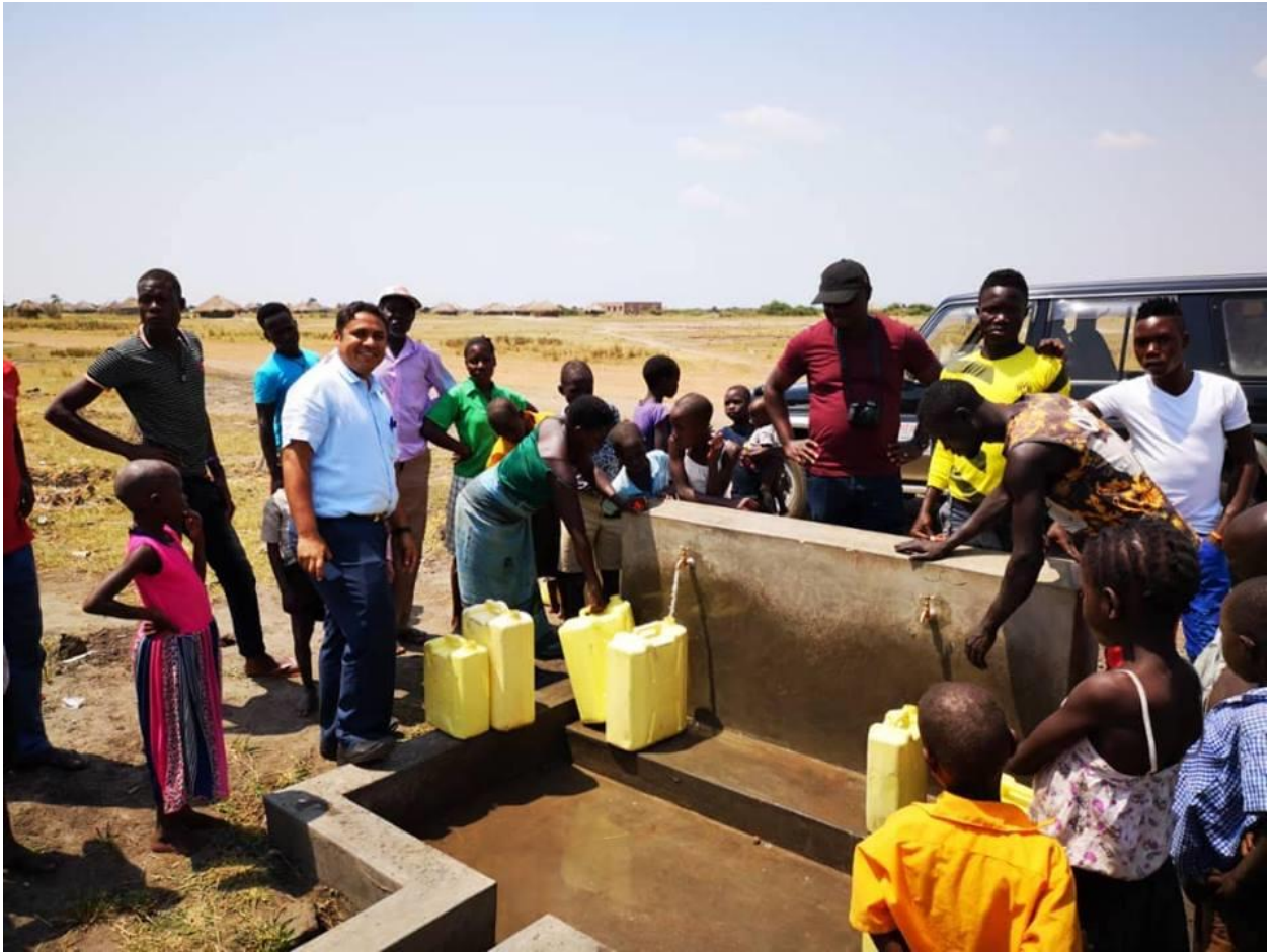
Residents of Bugoigo-Walukuba-Butiaba enjoying clean, safe and reliable water