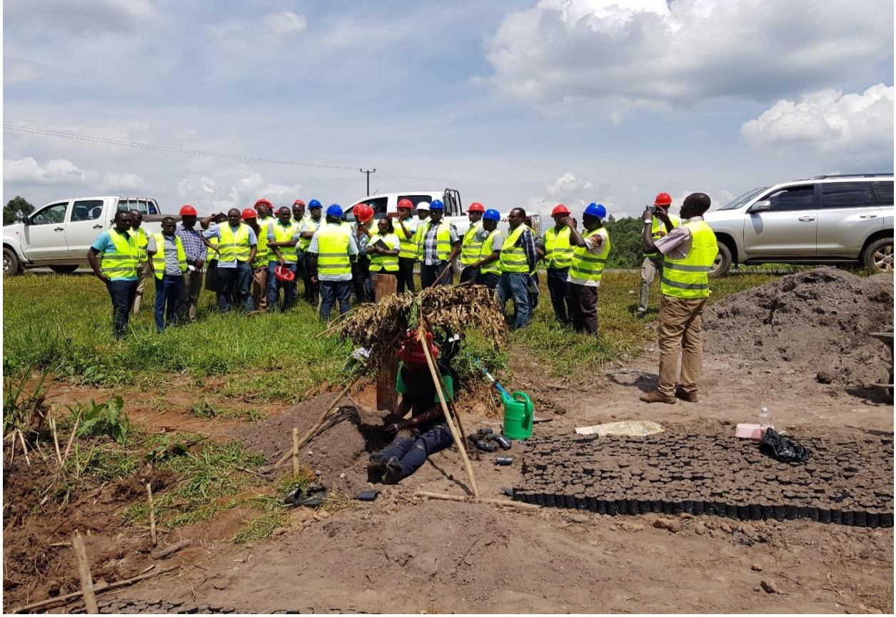
Officials inspecting the status of tree nursery beds on the Zigoti-Sekanyonyi piped water supply system.