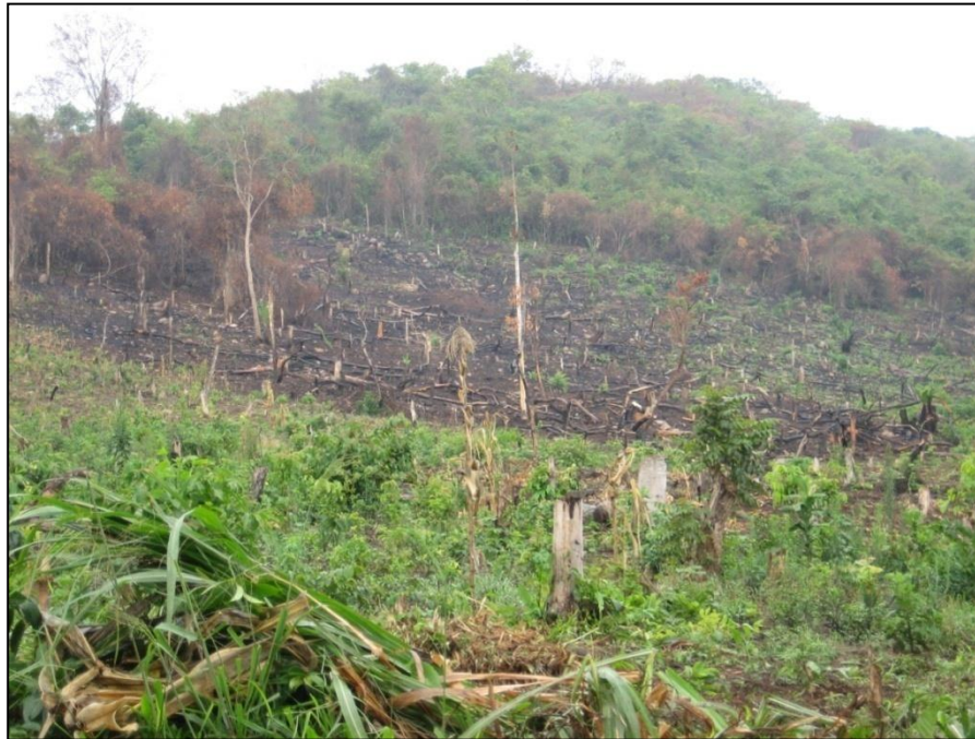
Plate 3.2: Forest Cleared for Agriculture in Hoima District

districts of Amuru (some 1800 sq km), Buliisa (roughly 800 sq km), Hoima and Bundibugyo. Deforestation in Kyenjojo and Kibaale Districts is apparent, and during the field visit conducted for this study in March 2011, it was observed that large areas of land in the Lake Albert catchment were being cleared for agriculture, particularly in Hoima District.