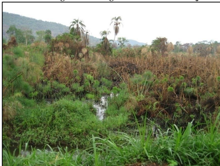
Plate 3.1: Burning and Clearing of Wetlands in the Project Area

Large areas of swamp are found around Lake George, in the Semiliki River at its inflow into Lake Albert and at the Albert Delta in the north of Lake Albert, as well as in the catchment areas of both lakes. It was observed that wetlands and swamps in the Project area are being drained and cleared for agricultural purposes, which is likely to have impacts on the water levels as well as water quality of the lakes 2 . In Uganda, wetlands that lie outside protected areas are not gazetted. In 2001 the National Wetlands Programme drew up a wetlands inventory, but this did not indicate which wetlands were managed sustainably. Moreover, over the past decade, a number of wetlands have been drained, destroyed or have dried up, and therefore the inventory needs to be updated.