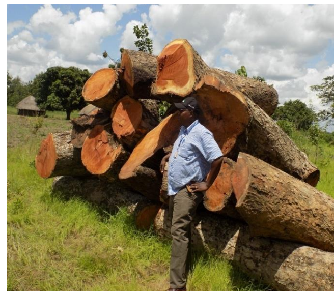
ENR CSOs Chairperson on an illegal logging tracking mission (together with NFA staff) in Palabek Ogili, Lamwo District.

Source: ENR-CSOs Annual Performance Report, 2018.