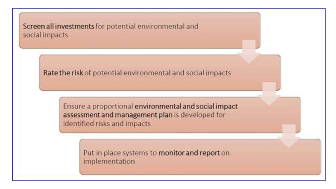
Fig 1: Demonstration of the adherence to the ESS process

The following flow chart describes the process of ensuring that the ESS process is adhered to: