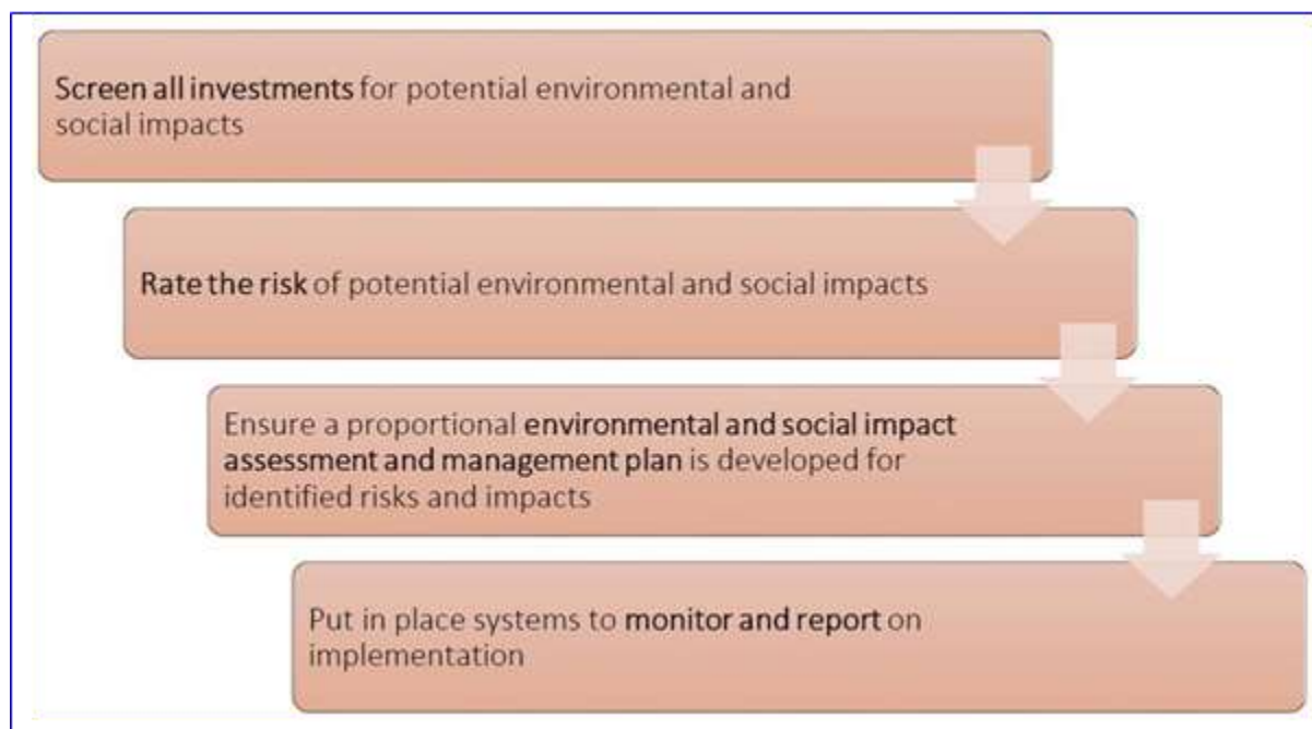
Fig 1: Demonstration of the adherence to the ESS process

The following flow chart describes the process of ensuring that the ESS process is adhered to: